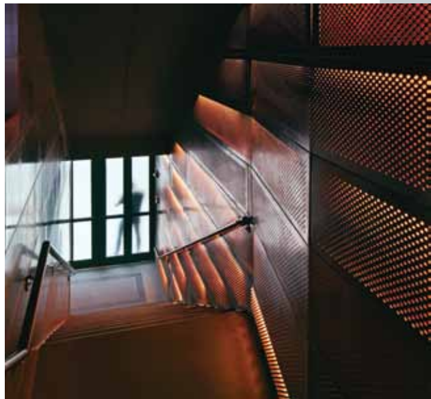
Please contact us for standard dimensions and thicknesses of copper, weathering steel, and stainless steel.